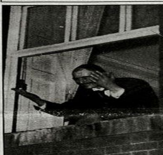
Mr. Chamberlain speaking from an upstairs window at No. 10 Downing Street, to the great crowd which gathered to welcome him home.